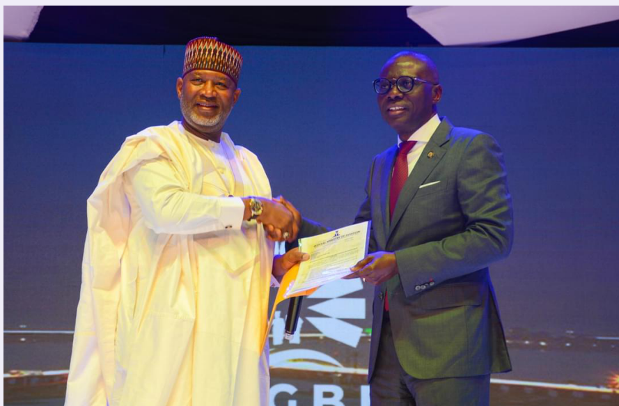
■ Minister of Aviation Sen. Hadi Sirika presents the approval document to Governor of Lagos state, HE, Babajide Sanwo-Olu during the Lagos Economic Summit 2022

He said: "Granting the licence for the airport project is a right step in the right direction. For us, it is all about partnership for the greater good of our State. The real beneficiaries are the citizens and the businesses that will be using the infrastructure to