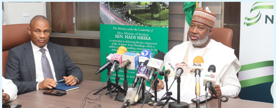
Minister of Aviation Sen. Hadi Sirika with Permanent Secretary at a press conference to announce preferred and reserved bidders for airports concession programme in Abuja

The preferred bidder for Murtala Mohammed International Airport