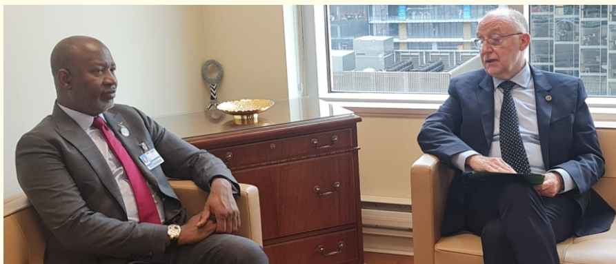
■ Minister of Aviation Sen. Hadi Sirika with ICAO President Salvatore Siacchitano during the visit by the Minister.

ICAN event holding in Nigeria will be a resounding success just like the earlier ICAO events hosted by the country.