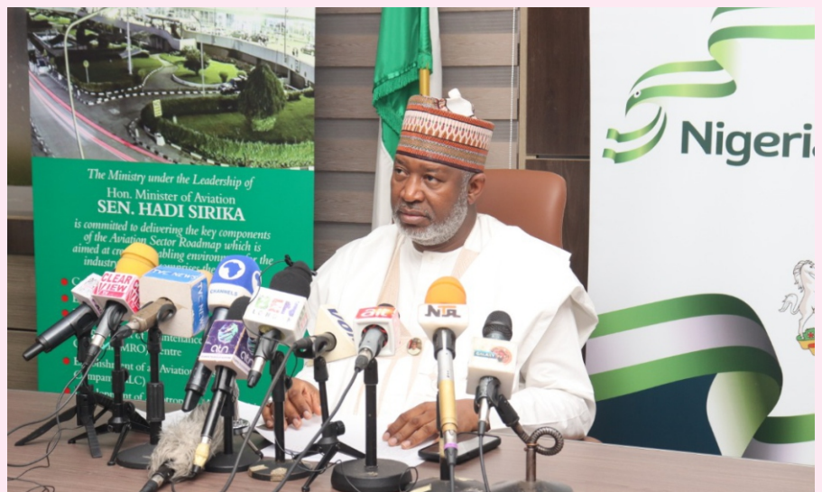
■ Senator Hadi Sirika, Minister of Aviation

Sirika noted that for the first academic