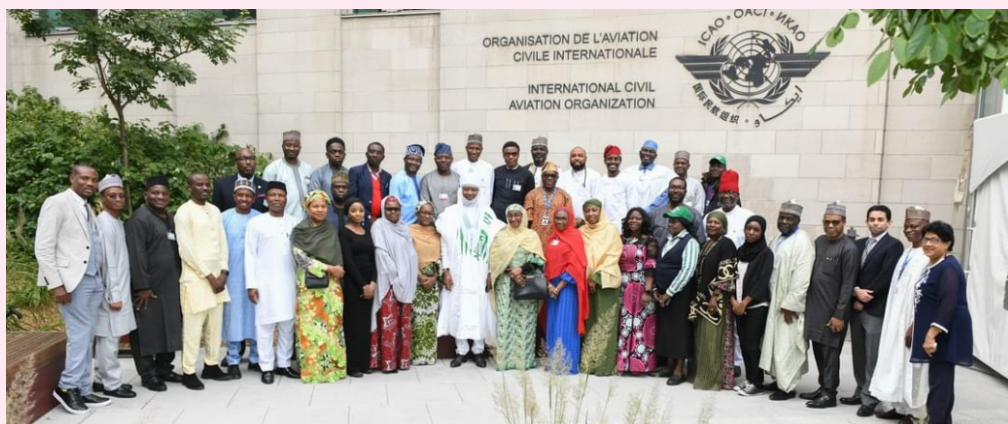
■ A group of Nigerian delegation led by Honourable Minister of Aviation, Hadi Sirika at the 41st ICAO Assembly in Montreal, Canada.

It was a celebration galore for Nigeria in Montreal Canada as it won re-election into the Part 2 of the International Civil Aviation Organization (ICAO) Council.