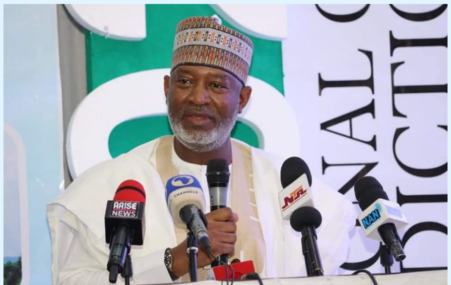
■ Senator Hadi Sirika, Minister of Aviation

Sirika cautioned foreign airlines to refrain from using social media to place their demands rather than resorting to diplomatic channels. According to him, foreign airlines