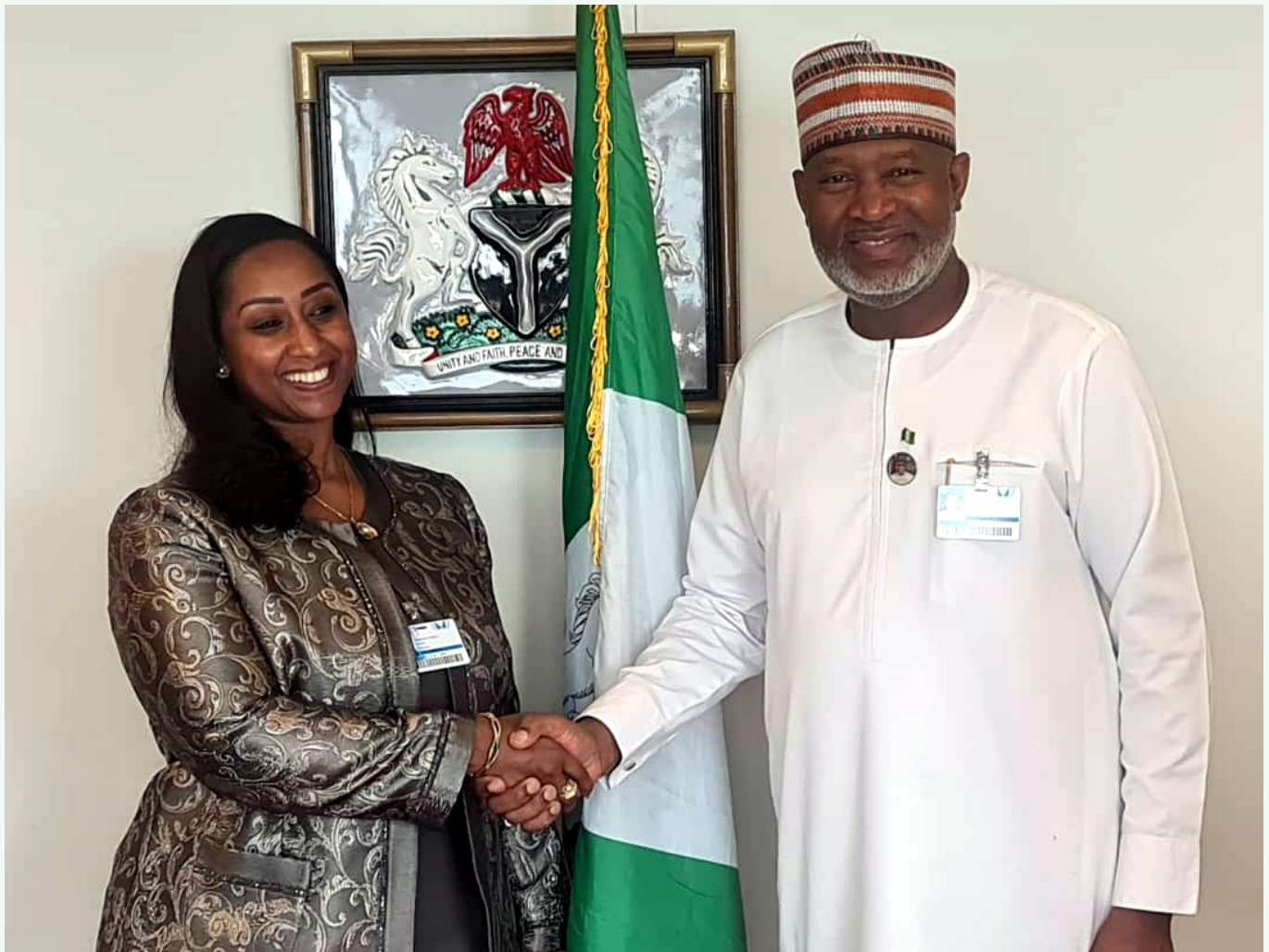
■ Ethiopian Minister of Transport and Logistics Mrs. Dagamawit Moges and Minister of Aviation Sen. Hadi Sirika

T he Nigeria Air project has been described as a partnership between the two highest populated African nations that will impact greatly the Aviation industry in the continent and intergovernmental relationships. This was the declaration of the Ethiopian Minister of Transport and Logistics, Mrs Dagamawit Moges when she led the country's delegation at the 41st General Assembly of ICAO on a courtesy visit to the Aviation Minister, Senator Hadi Sirika at the Nigerian ICAO Mission office in Montreal Canada. According to her, the government of Ethiopia, particularly, Ethiopian Airlines, is very excited about the partnership for the establishment of Nigeria's national carrier and hoped that it will open new vistas for