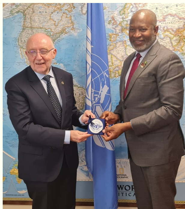
ICAO Council President, Salvatore Siacchitano with Aviation Minister Senator Hadi Sirika during the visit by the Minister.

The Minister reiterated Nigeria's commitment to the ideals of the organisation, and its readiness to continue to assist lesser privileged