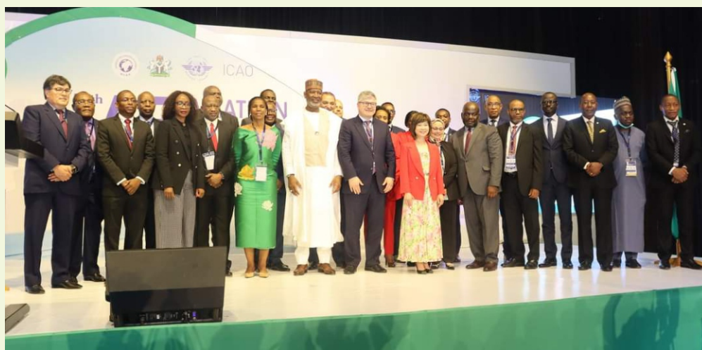
■ The Hon. Minister of Aviation, Sen. Hadi Sirika (L) with NCAA DG, Capt. Musa Nuhu (3rd R) in a group photograph with other eminent dignitaries at the opening ceremony of the 7th AFI Region Conference held on Monday-16th May, 2022 in Abuja, Nigeria

...seeks for reviving of ICAO's Human Resource Development Fund (HRDF)