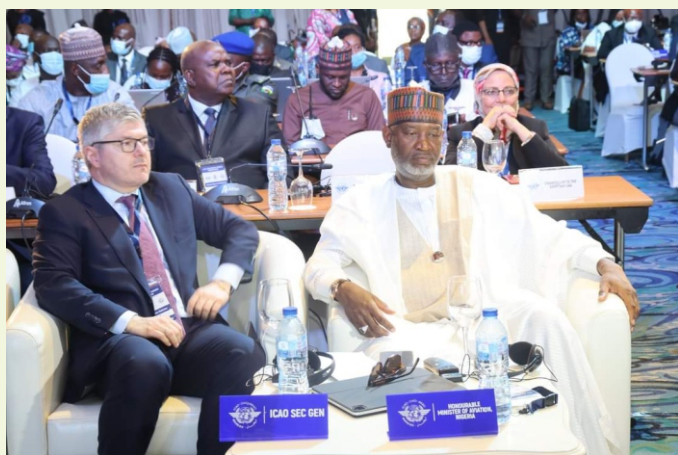
ICAO Secretary General, Juan Carlos Salazar and the Hon Minister of Aviation, Senator Hadi Sirika, at 7th AFI meeting in Abuja

"It is important for the implementation of AU Agenda 2063. One of the key components of the AU Agenda is Single Africa Air Transport Market," he said.