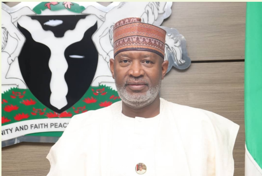
■ Minister of Aviation, Senator Hadi Sirika

In another development, since members of the Airline Operators of Nigeria (AON) issued a notice of withdrawal of flight services as a result of the rising cost of Jet A1 (Aviation fuel), and despite the initial statement by the Ministry, enquiries